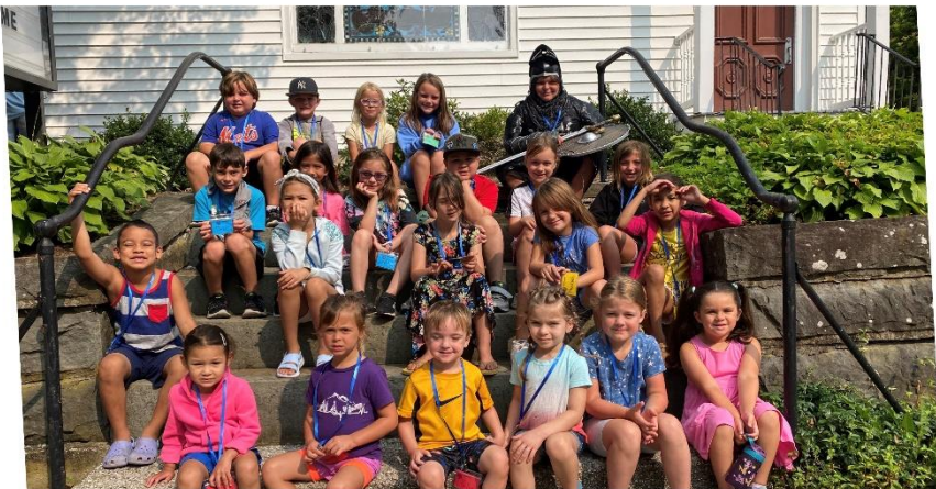
The black & white picture from 1946 and the color picture from 2023 show the kids from our church and the United Methodist Church at VBS! (Picture on left.)