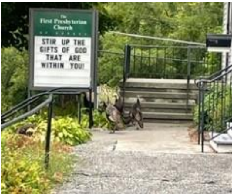
Look who stopped to read our sign....