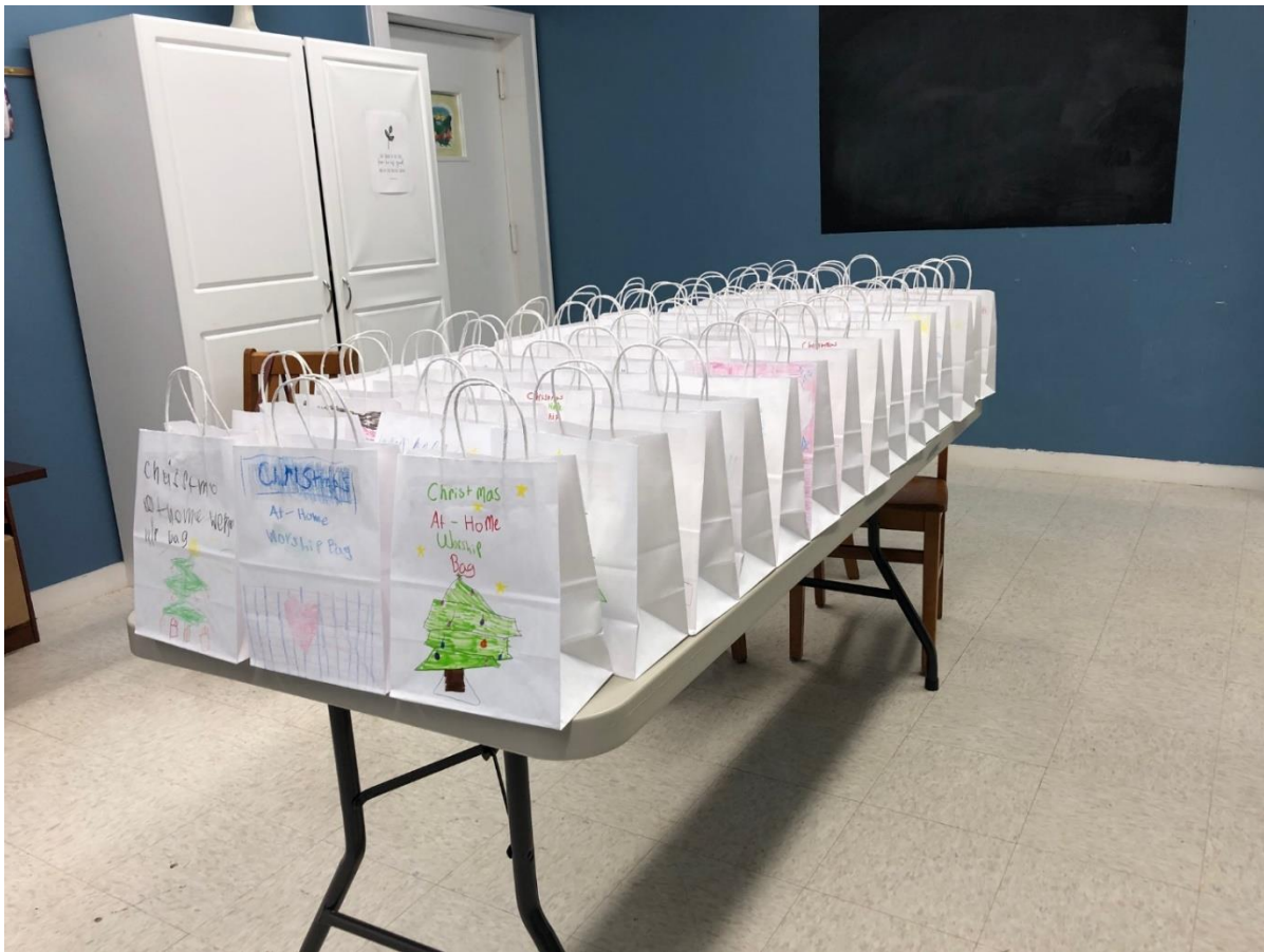
Christmas Day At-Home Worship Bags